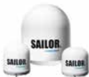
INMARSAT FLEETBROADBAND RANGE